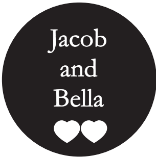
N9. Garamond Pro