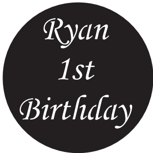
K7. Monotype Corsiva