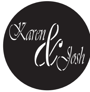
E4. Vivaldi Script English Script