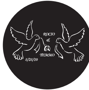
C2. Monotype Corsiva Times New Roman