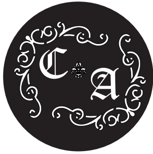
E3. Old English Text MT