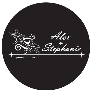
A3. Vladimir Script Lucinda Calligraphy