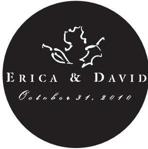
C3. Times New Roman Champagne Script