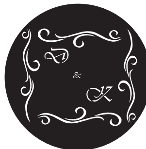
C10. Vivaldi Italic