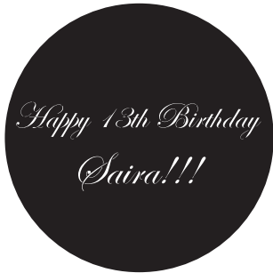
K5. Edwardian Script