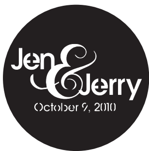
A9. Arial Chopin Script