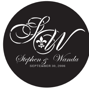
E8. Bickham Script Swash Sloop Script Edwardian Script Palace Script Arial