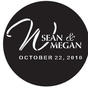
E2. Scriptina Pro Trajan Pro English Script Arial