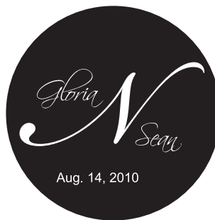
A10. Bickham Script Std Scriptina Pro Arial

Not all designs will fit every image area. Alterations may be made in some instances.