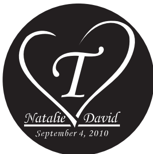
C9. Monotype Corsiva