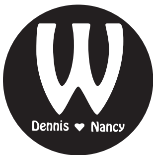
A5. Hobo Std. Medium