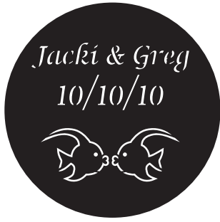
E1. Lucida Calligraphy Italic