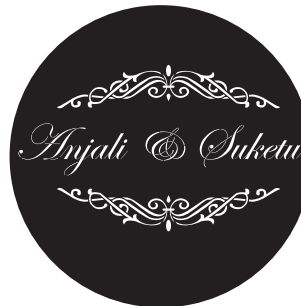
C8. Edwardian Script