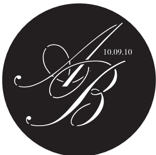
H9. Kunstler Script Times New Roman