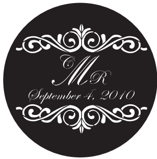
E9. Edwardian Script English Script